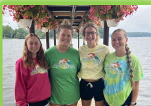
Freeman Bay Crew @ Last Year's Event