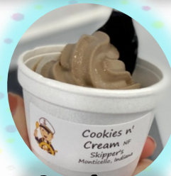
Cookies n' Cream